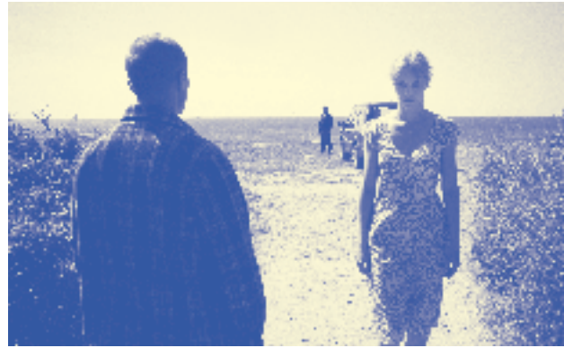
Christian Petzold, Jerichow , 2008