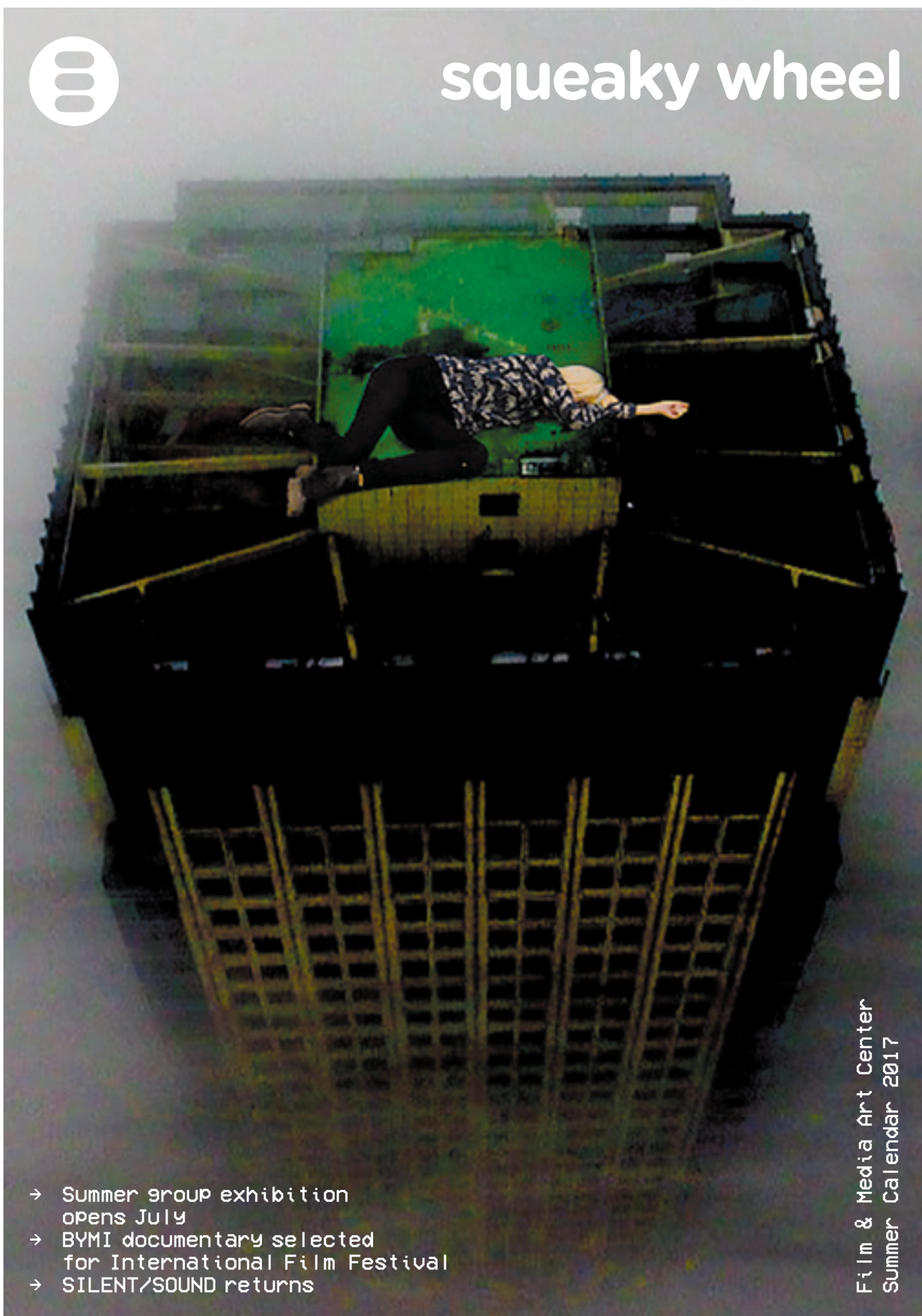
Film & Media Art Center Summer Calendar 2017