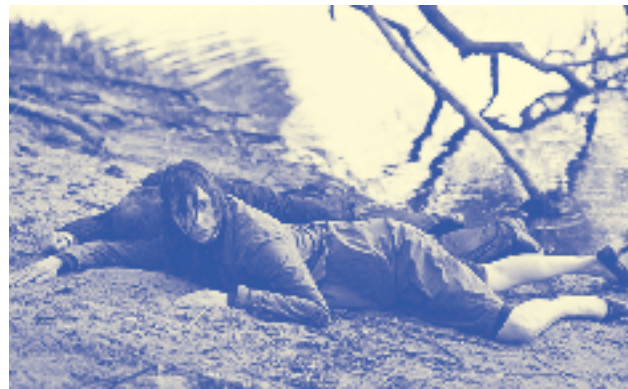
Christian Petzold, Yella , 2007

"An enigmatic thriller. The kind of movie that tantalizes the mind." —Stephen Holden, The New York Times